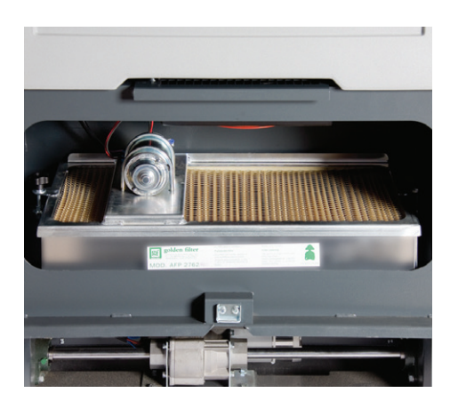
A tools-free dust filter contains a baffle system to filter out larger particles and extend life of the panel filter. A large four-sided steel debris hopper includes transport dolly wheels for ease of use and operator safety.