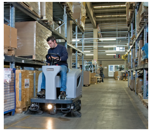
Superb maneuverability and tight turning radius permits cleaning in congested areas. Perfect for narrow aisle cleaning.