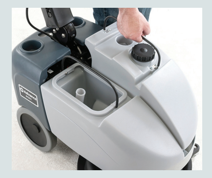
Easily remove the recovery and solution tanks to fill, drain and clean them away from the machine.