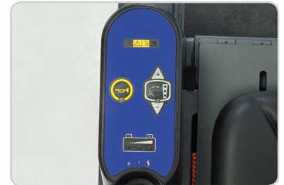
Simple one button control panel. (2800 ST model only)