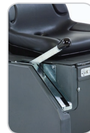
Mechanical deck lift lever. (2800 ST model only)