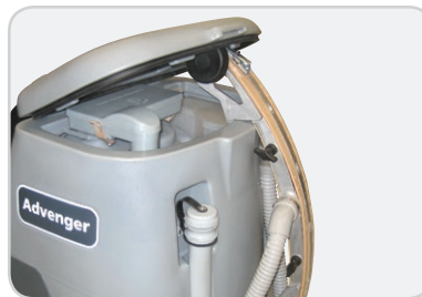
Built-in squeegee hanging system on tank for easy machine transfer and tank drying.