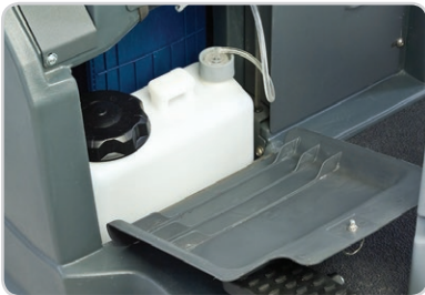
Easy access to onboard detergent dispensing system bottle on EcoFlex™ System.

High traction non marking urethane tires