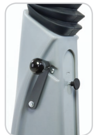
Mechanical squeegee lift lever located on steering column. (2800 ST model only)