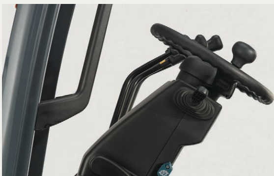
Smaller Steering Wheel

Toyota's sit-down counterbalance design prioritizes comfort and versatility. Controls are designed and positioned for easy access and intuitive functionality, enabling confident control of the forklift in forward or reverse. Add the ergonomic benefits of the smaller steering wheel, foot parking brake, weight-adjustable full-suspension seat and dual-side entry with assist grips. The result? Increased comfort and a more productive experience.