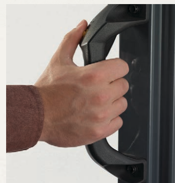
Rear Assist Grip w/Horn